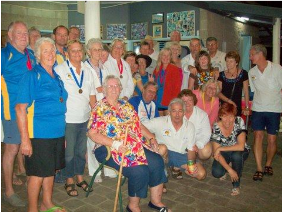
Participants and some of the helpers at the Swim Meet